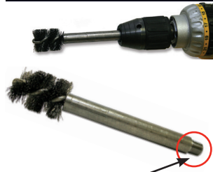
1/8" NPT (National Pipe Thread Taper)

Proper hole cleaning using a brush is essential to achieve optimum performance